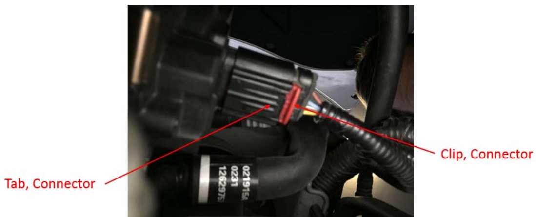
Figure 2. ECM Connector viewed from underside.