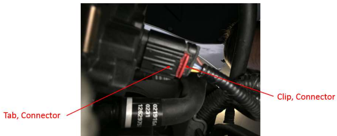
Figure 2. ECM Connector viewed from underside.