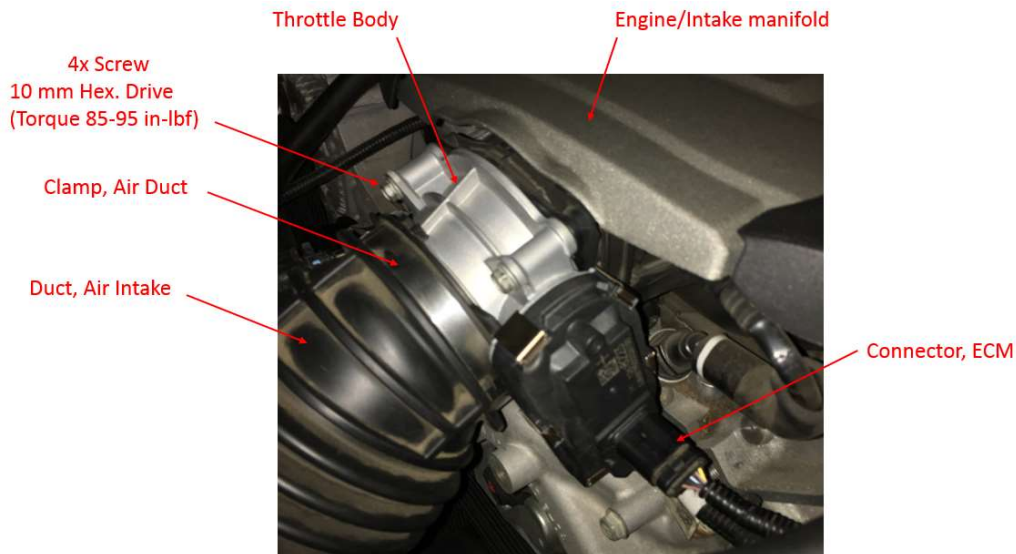
Figure 1. Throttle Body and mating components viewed from left (driver) side.