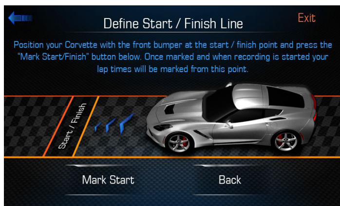
Set Finish Line Screen