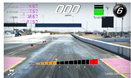
Performance Timing Overlay