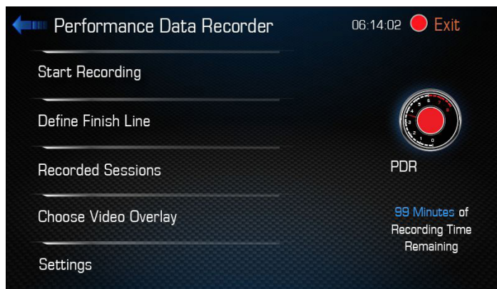
PDR Menu Screen